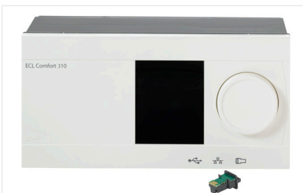
ECL Comfort 310 controller with application key

The A230 application key is a so-called four-in-one solution offering 1) temperature control in heating installations, 2) temperature control in cooling installations 3) control against too high humidity and 4) a floor (screed) drying program - dependent on the selected subtype of the key.