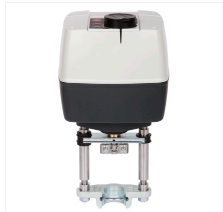
Electric actuator AMV/AME 65x

AMV and AME actuators are mostly used with VS, VM, VB and VFM valves or with pressure independent valves AVQM and AFQM.