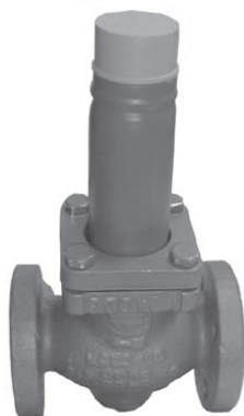
VFGS DN 15 - 125